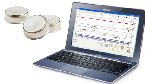
Works with every Thermo Boutons

Simply connect the Button to the reader, to get the graph, the list of temperatures, the list of excursions.