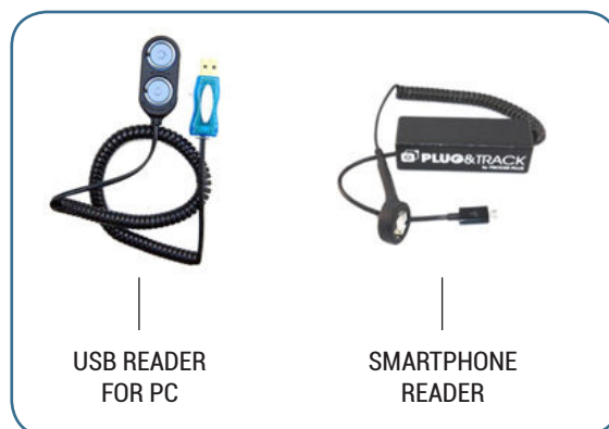
USB READER FOR PC