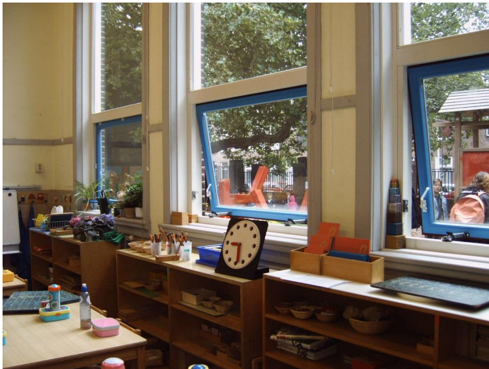
Figure 3. Open windows as much as possible during school hours and ensure airing during breaks.

In the long-term it obviously makes sense to structurally improve the ventilation, since poor indoor air quality leads to, among others, headache, fatigue and reduced learning performance.