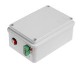
Back-Up UPS Lite Backup power supply. 12V, 1,3Ah