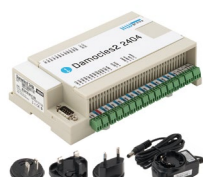
Damocles2 2404 set 24× DI, 4× DO relay, includes a power adapter