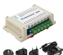
Damocles2 1208 set 12× DI, 8× DO OC, includes a power adapter