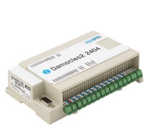
Damocles2 2404 24× DI, 4× DO relay, stand-alone device