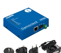
Damocles2 MINI set 4× DI, 2× DO relay, includes a power adapter