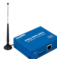
HWg-SMS-GW3 GSM gateway for ring and SMS notification